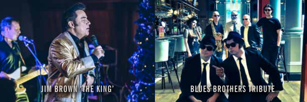
JIM BROWN 'THE KING'